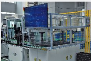
AUTOMATED ASSEMBLY LINE