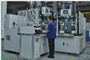
AUTOMATED ASSEMBLY LINE