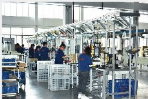
AUTOMATED ASSEMBLY LINE